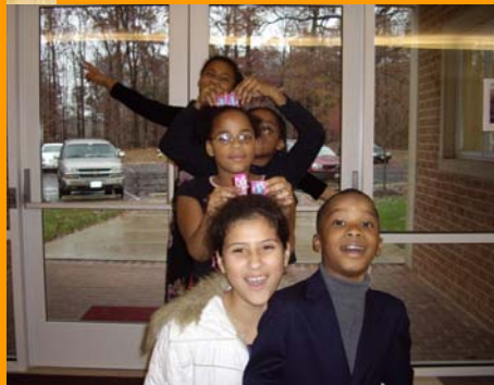
The CBC Youth are Thankful for God's Goodness!